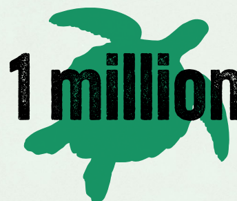
Species at risk of extinction from human-caused climate change

Political obstructionists in the United States — science deniers primarily fueled by biblical doctrine, hubris or just plain greed — are playing their fundamentalist fiddles while Rome burns. Responsible stewards must protect reproductive rights and employ science and evidence-based decision-making to save this world, our only world.