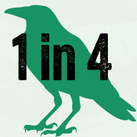
North American birds lost since 1970

In a religious quest to “have dominion over every living thing that moves upon the earth,” humans have encroached upon and befouled our planet. The extinction rates are alarming: