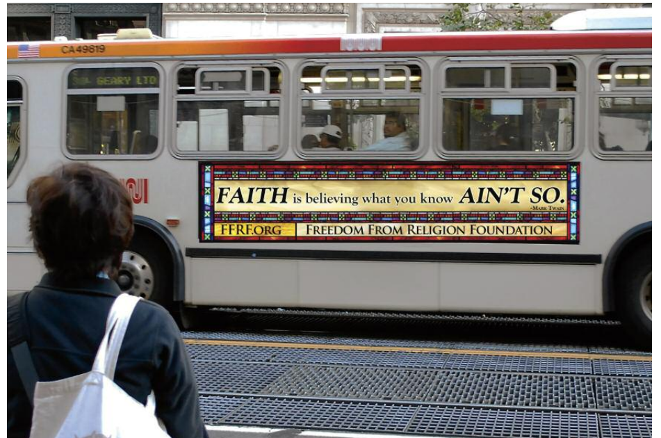
This quote from Mark Twain is one of two messages running on 75 buses in San Francisco. For story, see front page.