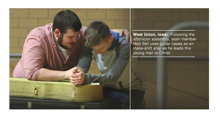
A Todd Becker Foundation member prays with a student following an in-school assembly. 12 Source:

These one-on-one prayers are disturbingly intimate. The Todd Becker Foundation newsletter and Facebook page showcase dozens of instances of foundation team members touching, embracing or hugging students. The foundation often takes photos of these interactions to use on social media and promotional materials. After these conversations, the foundation collects the student's personal information so that local clergy can continue to contact students long after the foundation has left. 11