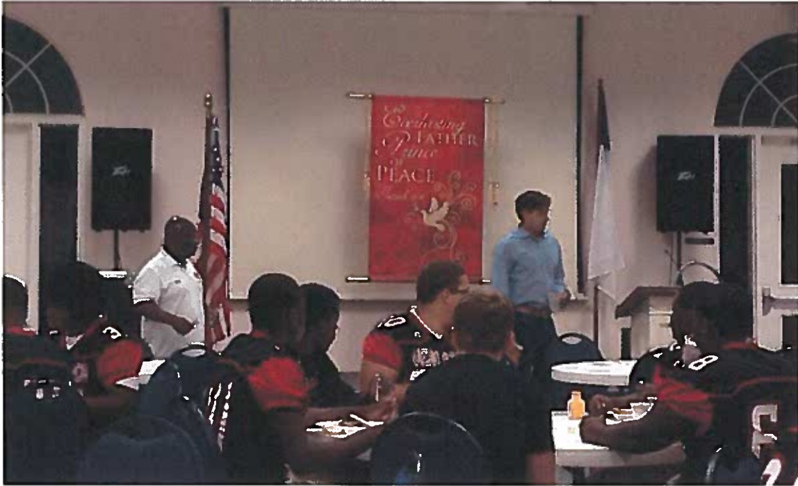
Vero Beach Football · VBFootball · 12 Sep 2014 Thank you FCA and @rwhemaword for once again putting on a great team breakfast at First Baptist Vero! #VEROnation