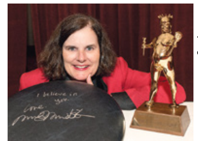
Paula Poundstone at convention.

FFRF's 40 th annual national convention in Madison Sept. 15-17 contrasted with erudite cautions about Religious Right threats by notable columnists Katha Pollitt of The Nation and Michelle Goldberg of The New York Times , with humorous breaks by atheist comedians Paula Poundstone and Julia Sweeney .