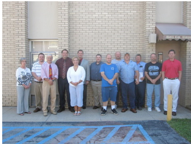
BELL COUNTY SCHOOLS DISTRICT ENERGY TEAM