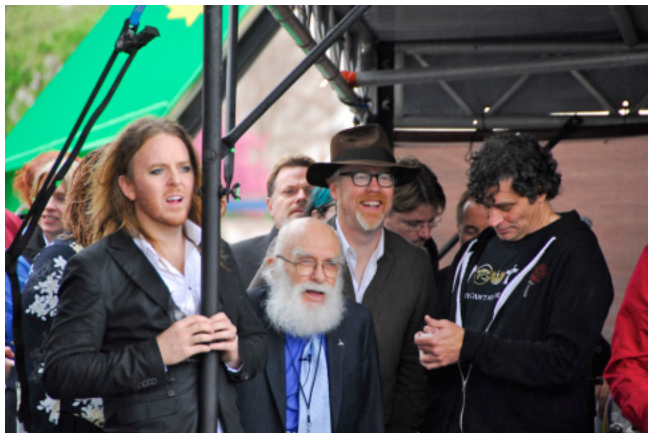
Musician Tim Minchin, the Amazing James Randi and "Mythbusters" Adam Savage wait in the wings to go on stage.