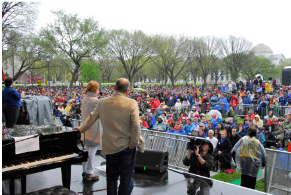
At least 10,000 people attended the Reason Rally on the National Mall in Washington, D.C. It was sponsored by secular groups, including FFRF.