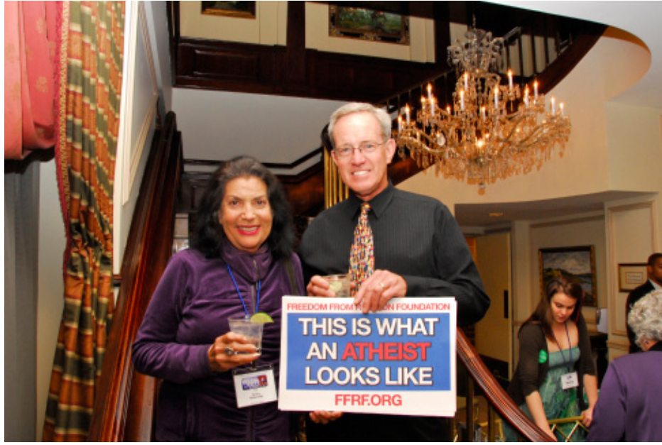
Attendees pose with FFRF's Reason Rally placards the night before the big event.