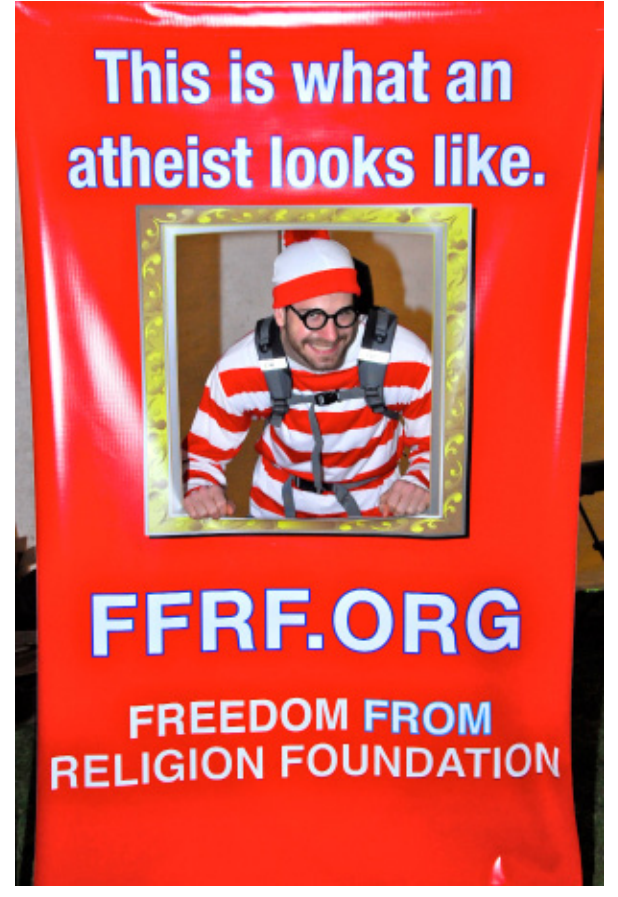
Who knew Waldo was an atheist?