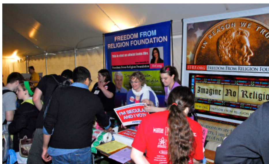
FFRF handed out thousands of free placards and goodies at its popular booth at the Reason Rally.