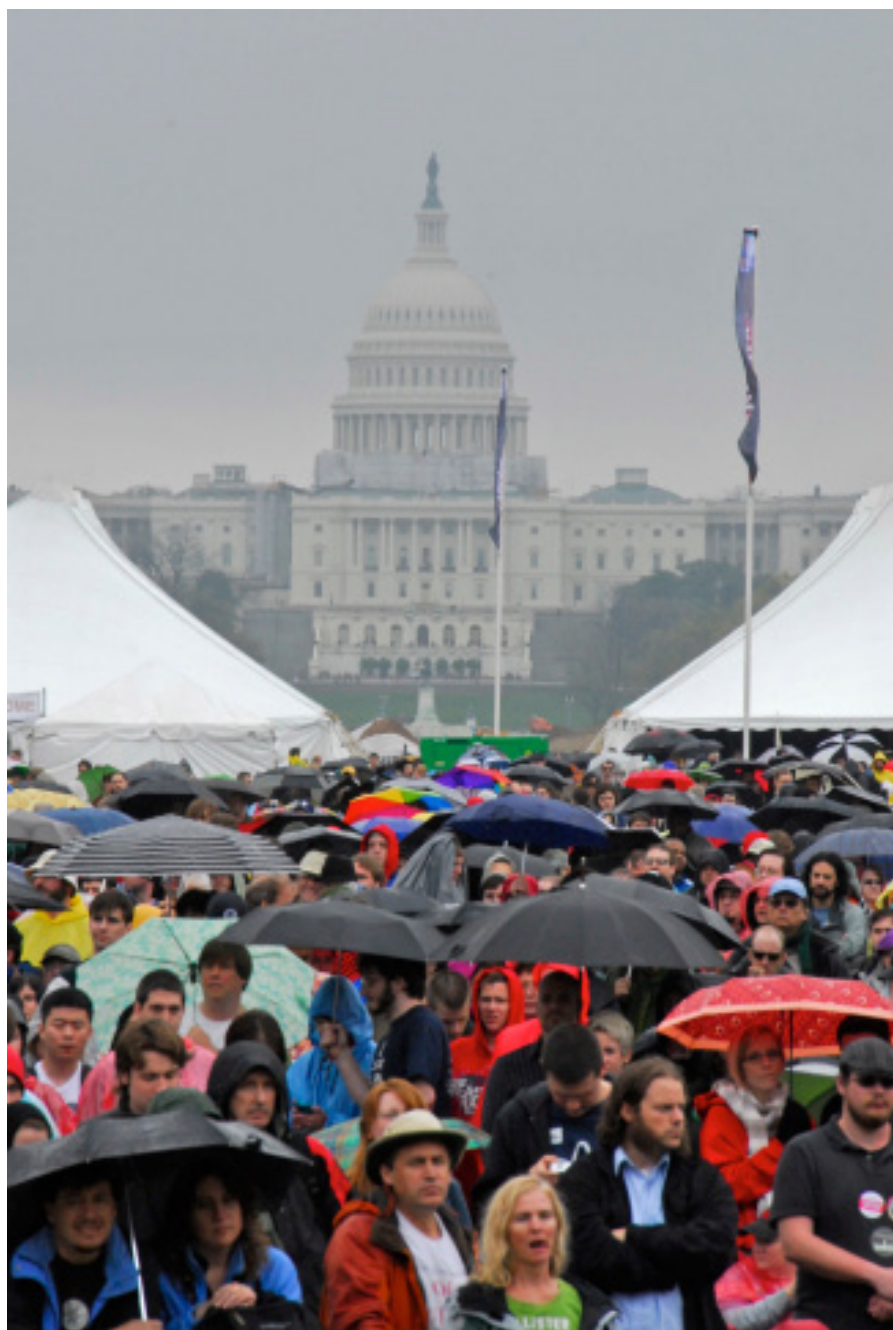
Rain off and on didn't spoil this parade.